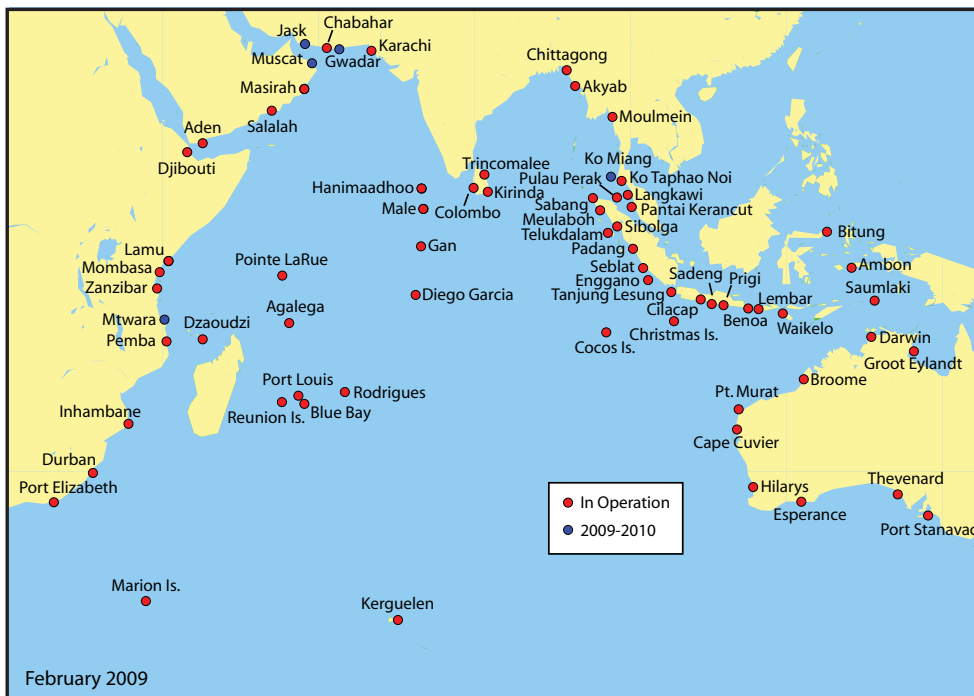
Figure 2. Sea level network of the Indian Ocean Tsunami Warning System (IOTWS)